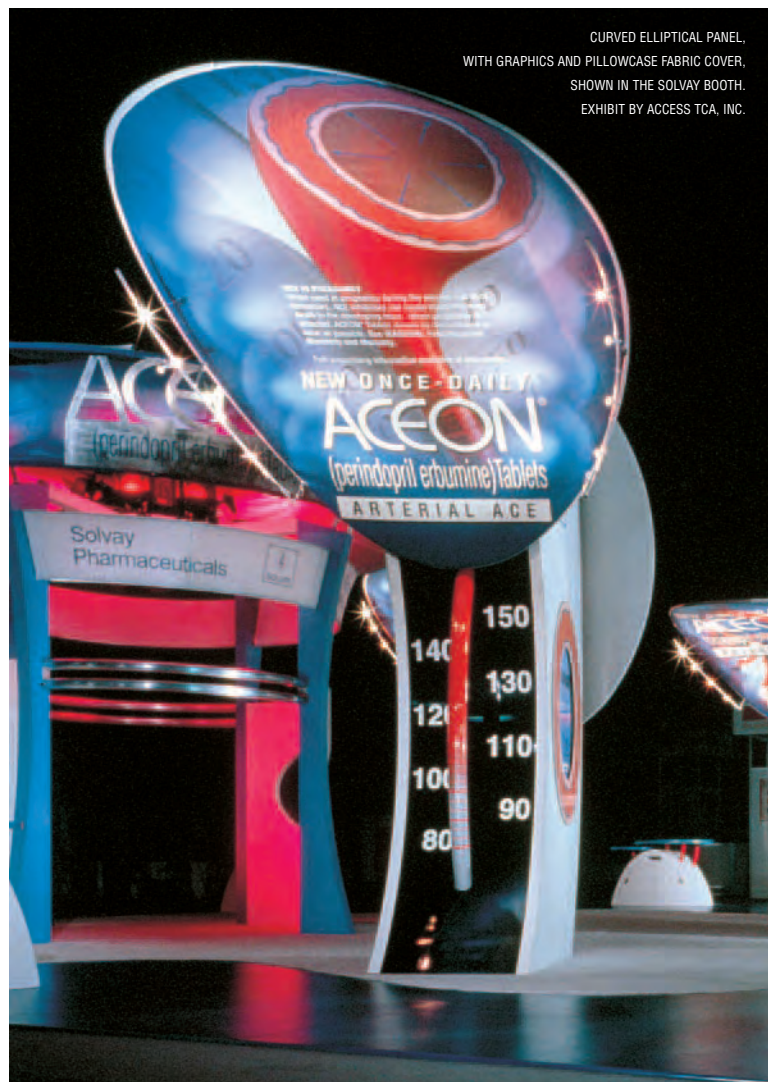
CURVED ELLIPTICAL PANEL, WITH GRAPHICS AND PILLOWCASE FABRIC COVER, SHOWN IN THE SOLVAY BOOTH. EXHIBIT BY ACCESS TCA, INC.