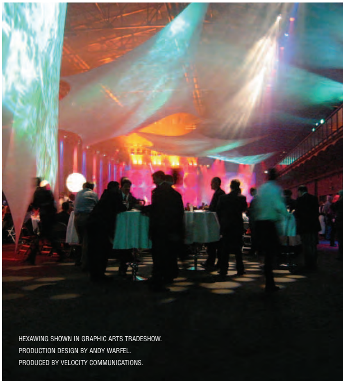
HEXAWING SHOWN IN GRAPHIC ARTS TRADESHOW. PRODUCTION DESIGN BY ANDY WARFEL. PRODUCED BY VELOCITY COMMUNICATIONS.