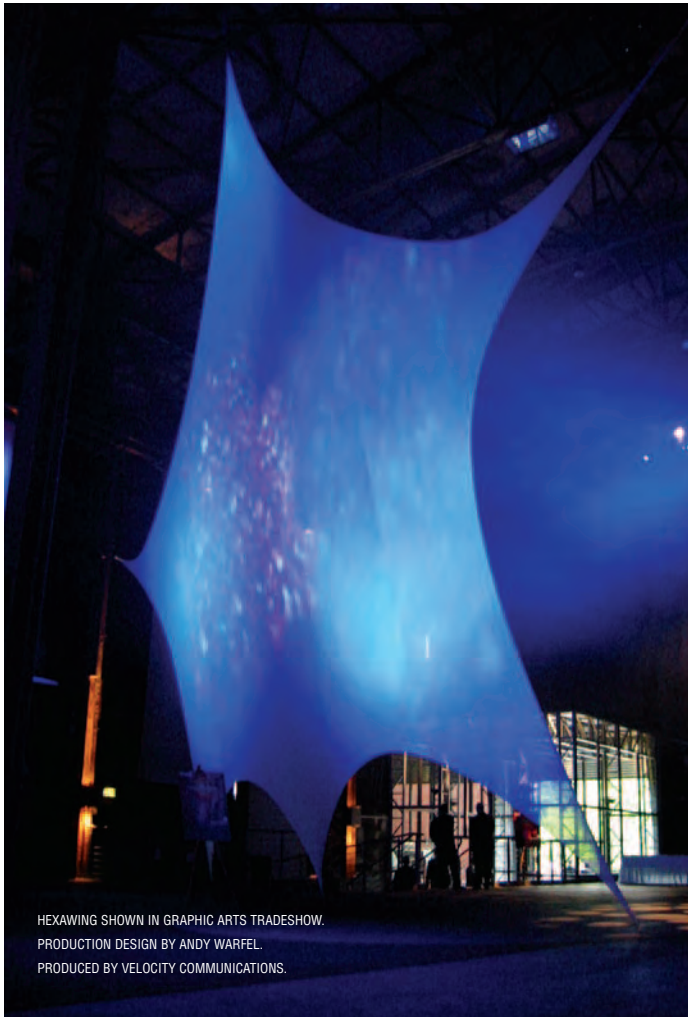
HEXAWING SHOWN IN GRAPHIC ARTS TRADESHOW. PRODUCTION DESIGN BY ANDY WARFEL. PRODUCED BY VELOCITY COMMUNICATIONS.