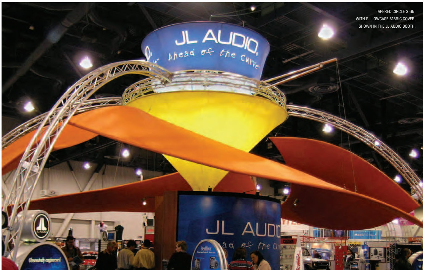
TAPERED CIRCLE SIGN, WITH PILLOWCASE FABRIC COVER, SHOWN IN THE JL AUDIO BOOTH.