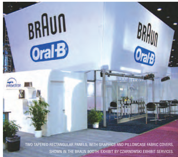
TWO TAPERED RECTANGULAR PANELS, WITH GRAPHICS AND PILLOWCASE FABRIC COVERS, SHOWN IN THE BRAUN BOOTH. EXHIBIT BY CZARNOWSKI EXHIBIT SERVICES.