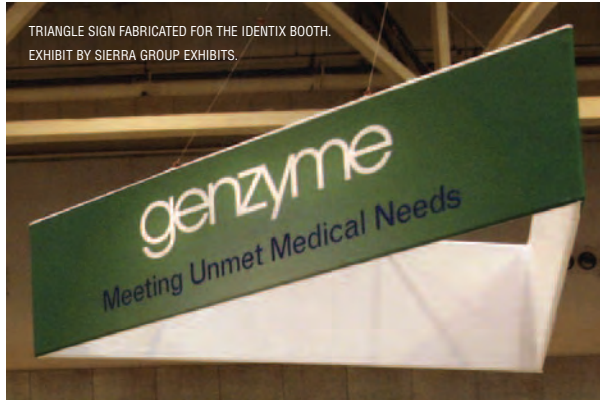
TRIANGLE SIGN FABRICATED FOR THE IDENTIX BOOTH. EXHIBIT BY SIERRA GROUP EXHIBITS.