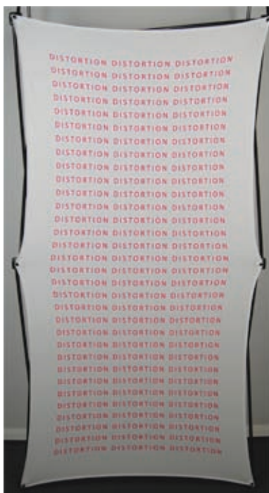
3" in - distortion becomes more apparent