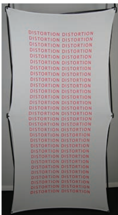
5" in - least amount of distortion