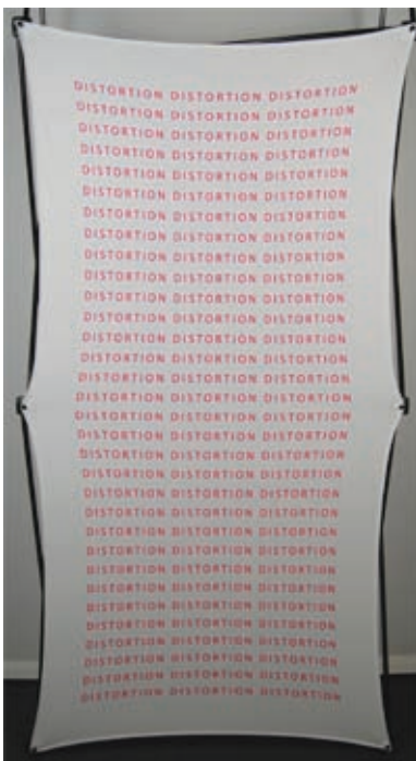
3" in - distortion becomes more apparent