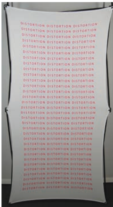
3" in - distortion becomes more apparent