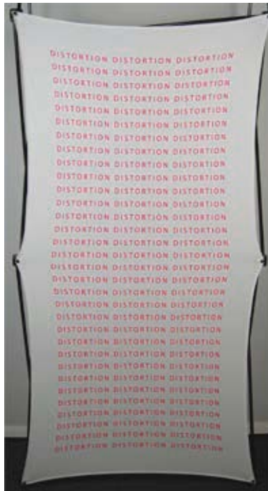
3" in - distortion becomes more apparent