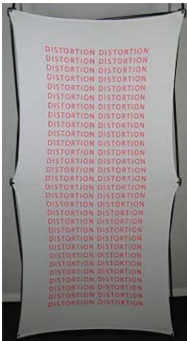
5" in - least amount of distortion