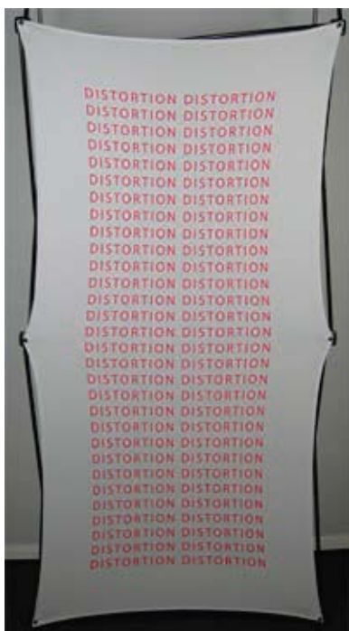
5" in - least amount of distortion