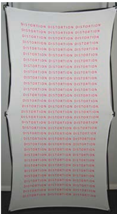
3" in - distortion becomes more apparent