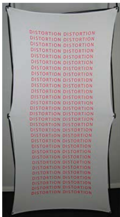
5" in - least amount of distortion