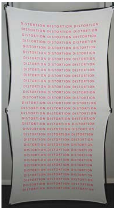
3" in - distortion becomes more apparent